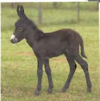
HHAA Ultra Violet 2.jpg

The American Donkey & Mule Soc PO Box 1210 Lewisville TX 75067 (972) 219-0781 www.lovelongears.com