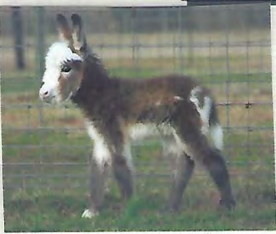
HHAA Marvel 4.jpg